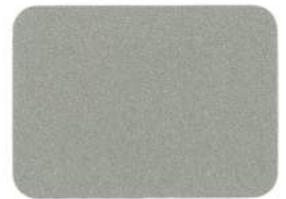
◆ Metallic Champagne

PLEASE NOTE: The colors listed on this color chart are as close to the actual painted metal as possible. Actual color swatches are available upon request. Trinar® pre-finished galvalume steel and aluminum containing Kynar 500® and Hylar 5000®