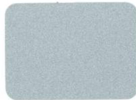
◆ Metallic Silver