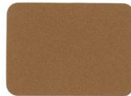
◆ Metallic Copper